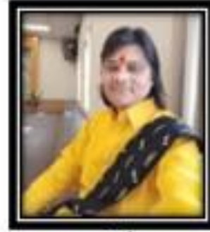
Acharya Ram Naresh Vajpayee